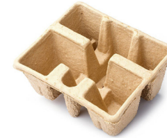
Molded Pulp Packaging